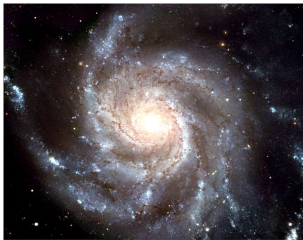
Spiral Galaxy M101

The great mysteries of birth and death, and of our temporal existence, came into our consciousness. Natural occurrences such as night and day, thunder and lightning—all these may have been viewed as terrifying, inexplicable events. Perhaps to make sense of the strange world that surrounded us, we attempted to explain these phenomena through fanciful tales, a multiplicity of gods, or by other means. But the power of thought is a driving force behind our conscious evolution and comprehension of all things, and therefore, over time, science and understanding began to develop. As our understanding of physical phenomena increased, so also did our knowledge of, and answers to questions about, physical phenomena. As we freed ourselves from some of our fears and physical distractions, we gradually developed more time for reflection upon our conscious existence.