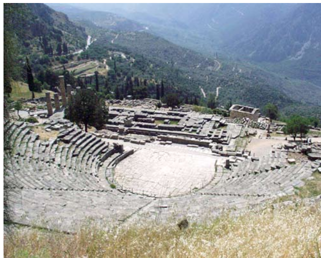
Overlooking the Delphi theater and Temple of Apollo.

Humanity's quest continues to define itself, and there is a realization among many that there is more to life than our outer surroundings. The journey to find inner growth has begun, and great questions and