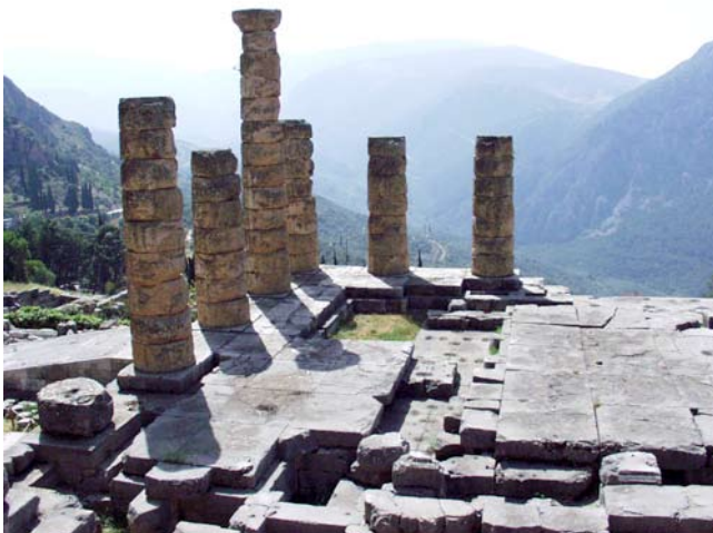
Partially reconstructed Temple of Apollo at Delphi.

Centuries later the sages of old passionately labored to assist humanity to see beyond our difficult physical existence. In so doing, they promoted an exploration of self in conjunction with scientific inquiry, for they knew that the contemplation of consciousness was vital to our existence. They knew that humanity is interconnected with all things.